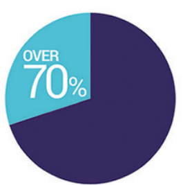
Over 70% of our executive search appointments are promoted within the first year.